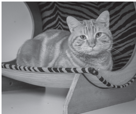
Hi! My name is Yeller.

My name is Yeller but not because I yell. Rather it’s because I have “yeller” fur with beautiful markings I’m told. I am 6 years old and my story is like so many others; I was found on the streets. Lucky for me, my rescuer was able to get me into StreetCats. Life here is really comfortable. There are windows to look out and plenty of toys to play with. I really enjoy playing with the fuzzy blue stick toy. You might be surprised to see how high I can jump to grab it! And I love to be petted. But I’m really looking for a home of my own. Perhaps it’s with you?