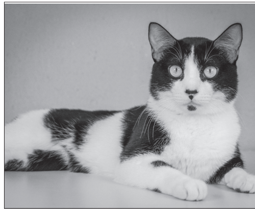
Hello, I'm Skippy and this is my brother, Blackie.