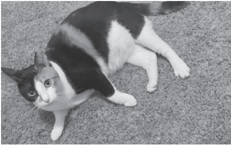
Mercedes, AKA Keto