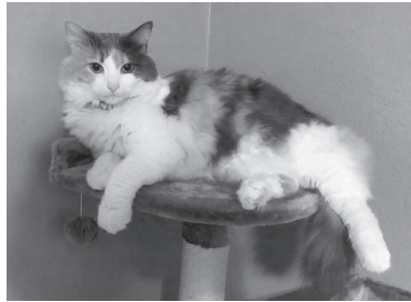
Julia, AKA Diana