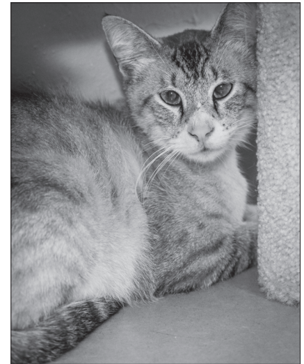
Hi! My name is Silver.

My name is Silver and I am a very handsome silver tabby point Siamese mix approximately 1½ years old. I was living on the streets until that freezing cold weather came along and a nice lady invited me inside. I discovered how wonderful it is to be an inside kitty! I slept on a warm bed with a human and loved sitting on a lap. But I prefer to make these decisions on my own. I don't particularly liked being picked up or told what to do. I do like to talk and they say I have a pretty loud purr. I am making some new friends here at StreetCats, both feline and human. I look forward to meeting you too.