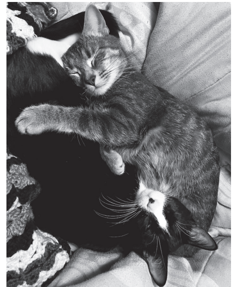
Leo and Van, now Ember and Ash