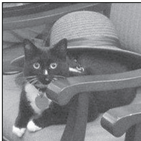
StreetCat Star helped Montereau residents celebrate Red Hat Day.

Star also visits The Abbey, Montereau's Alzheimer's and memory care community.