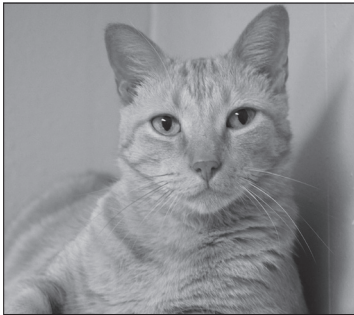
Hi! My name is Beamer

I'm an orange male tabby, and you might think I look a bit familiar – I have been in StreetCats twice before. I started out as a young man having been born in March 2009 but I was returned thanks to my owners remembering that StreetCats takes back their previously adopted cats if a family situation changes. The volunteers don't want any of their adopted cats to ever end up on the streets again, and I am so happy for this – I get to see my human friends again AND find a new home! I have an