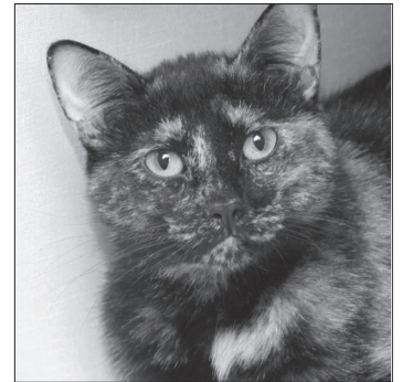
Hello everyone, I'm Sensi

I am a female tortoiseshell, around 3 years old. I am full of wonderful "tortitude," the name for the unique personality that often accompanies a tortoiseshell cat. True to form, I am independent, smart, strong-willed, feisty, and unpredictable. But don't let that scare you! I am one of the most delightfully crazy cats you will ever play with, and I absolutely adore love and cuddle time on your lap – just expect it to happen on my watch, not yours! I will let you know just what I am thinking, perhaps with joy... or perhaps something more vocal! I would be okay with another cat in the house, but I will most certainly be the dominant one; I may not do