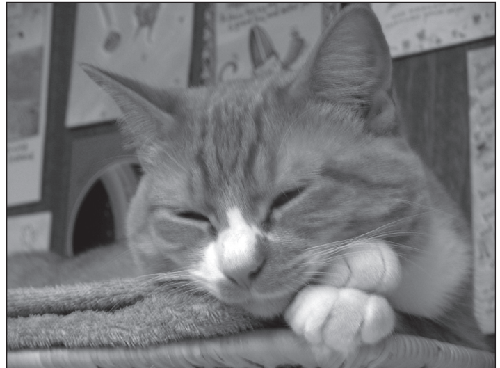
Mick relaxes at his new home.

His new owners then set out to make the proper introductions to their other animals. Mick spent a couple of days sequestered in their office so he could get comfortable with his surroundings and familiar with the smell of the greyhounds outside the door. On the third day, they placed two baby gates in the doorway, one on top of the other, so Mick could see the dogs while still feeling safe from them. Apparently he