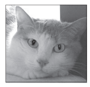
Joye likes to drink out of the sink faucet.