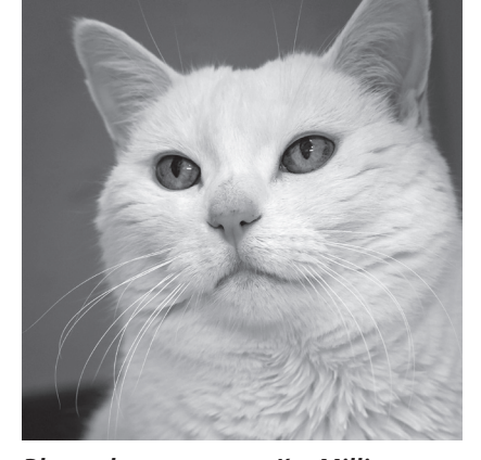
Pleased to meet you, I'm Millie.

me back and have made me very comfortable. I still enjoy play time and I do some exploring here but I'm not too happy with all the other kitties running around. I'm looking for a quiet home where I can share love for the next chapter of my life.