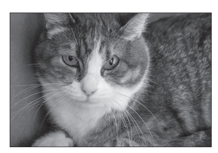
Hello, I'm Little Mama

They call me Little Mama because I already had kittens when I was rescued from the streets. I'm about 7 years old now, a quiet and petite blue tabby with white. I came to StreetCats with two other kitties who found a new home to-