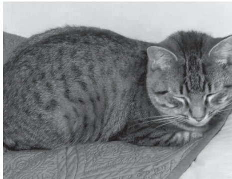
Spud, now Levi