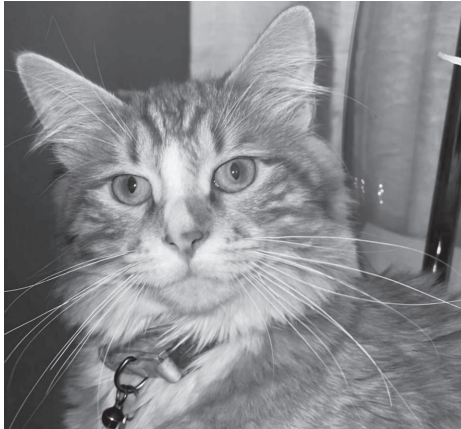
Tot, now Mango